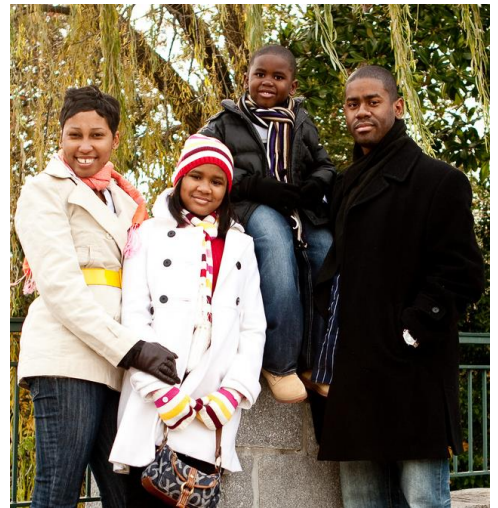
My family and me one winter in Georgia