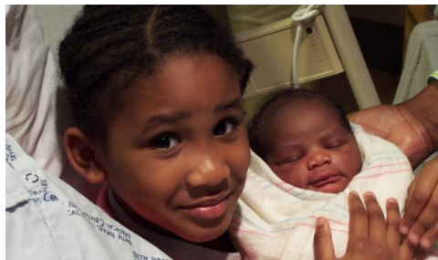
Holding my brother for the first time

Still, when my mother gently passed him over to me as we lay in the hospital bed, I felt my breath catch in my throat. I was aware of the fact that I held a tiny menace in my arms, but in an instant, all of his sins against me were forgiven.