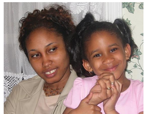
My mother and me after moving to America